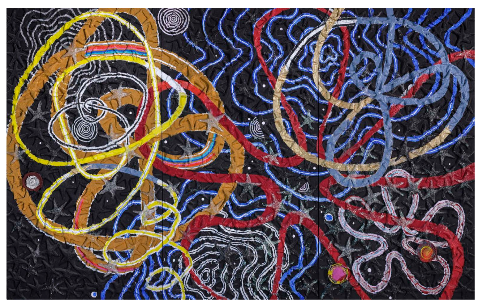
Nabil Nahas. Untitled. 2022. Acrylic on canvas. 290 x 450 cm @ Rabih Andraos. Image courtesy of the artist and Château La Coste

Two bronze sculptures mirroring imprints of the underside of brain corals stand upright like human figures, while out on the terrace, one of Nahas's trademark starfish seems to have escaped from his paintings to inhabit a 2.6 x 4-metre sculpture fabricated by Fusions Foundry in Auvergne in central France. His first time working in aluminium, it evokes a mysterious creature from the ocean's depths or outer space. It stems from a series of papier mâché maquettes that he has been playing around with