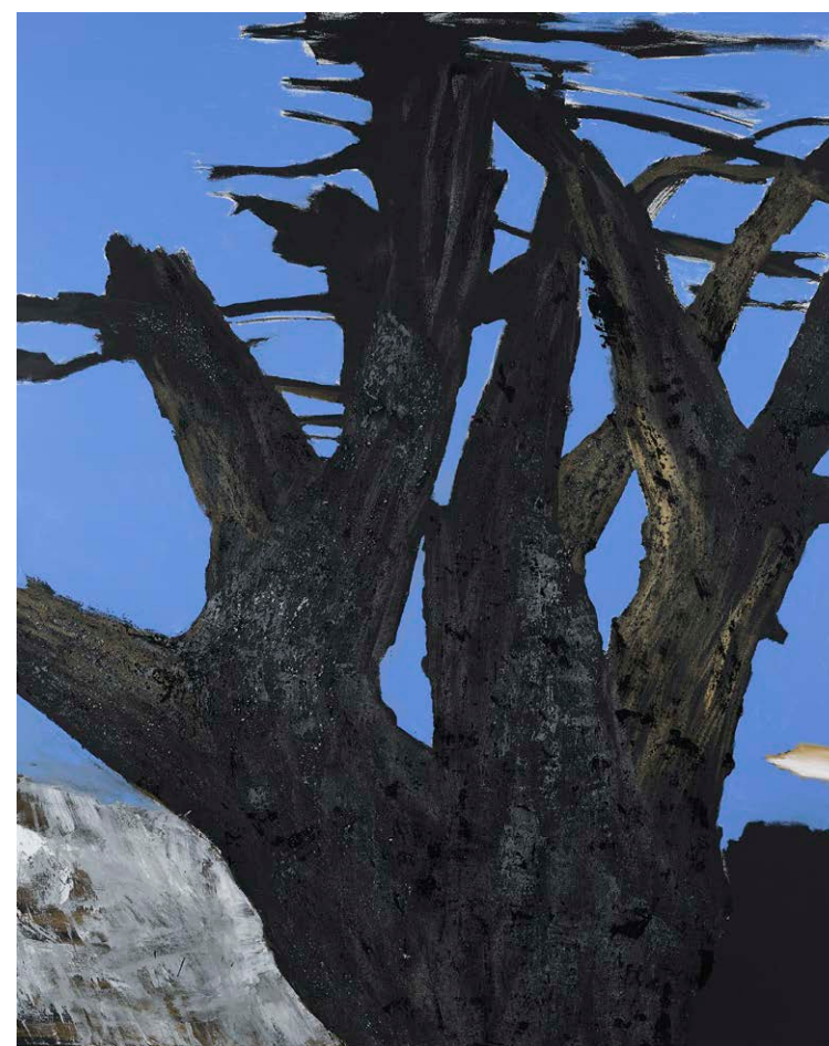
Left: Nabil Nahas. Untitled. 2022. Acrylic on canvas. 250 x 200 cm Right: Nabil Nahas. Untitled. 2022. Acrylic on canvas. 250 x 200 cm

and other heavenly bodies. Everything appears to be pulsating and in perpetual motion, giving the illusion of growing before one's eyes, stretching beyond the edges of the paintings. "I'm trying to duplicate the constant expansion of the universe, on every level," he notes. "I have always been very interested in something that was taboo and still is taboo in art: visual pleasure. When you take something from nature – a crystal formation or a fish in water – it's extraordinarily beautiful."