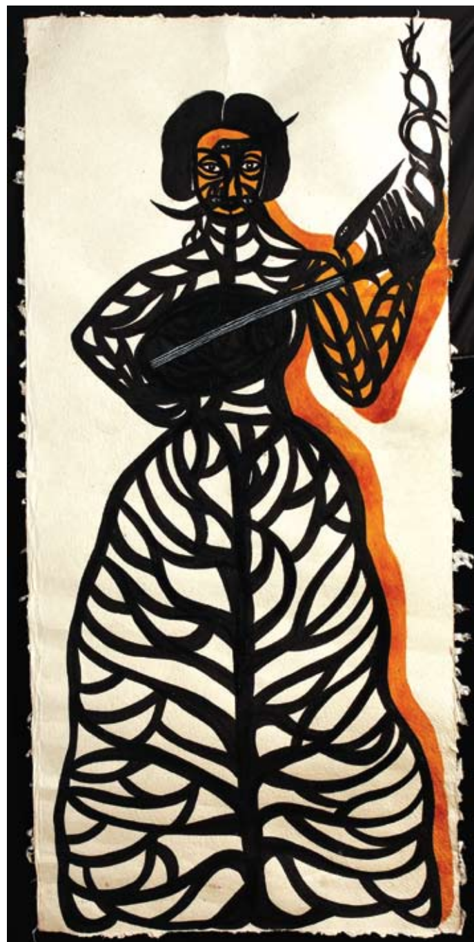
Facing page: Poet . 2011. Oil painting on canvas. 155 x 200 cm.