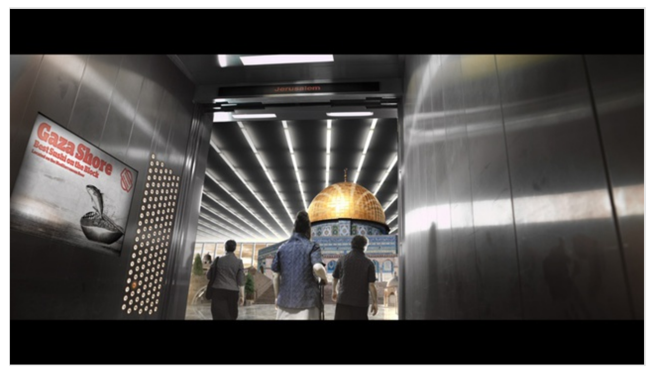
Larissa Sansour, Nation Estate , 2012, film still, 9 min. Courtesy the artist.

LS: I like this tension between utopia and dystopia. I think it is kind of universal. I try to have this play between locality and universal concerns. It is interesting for me how the post-apocalyptic condition that Palestinians are going through is actually something that we are all worried about. The only thing is that what is happening to Palestine is coming to us before its time, because of political reasons rather than environmental reasons. My work borrows from sci-fi, which deals a lot with the post-apocalyptic condition: what do we do in the future? Obviously this is all informed by what is happening in the present. How do we deal with this condition? What is it going to look like in the future?