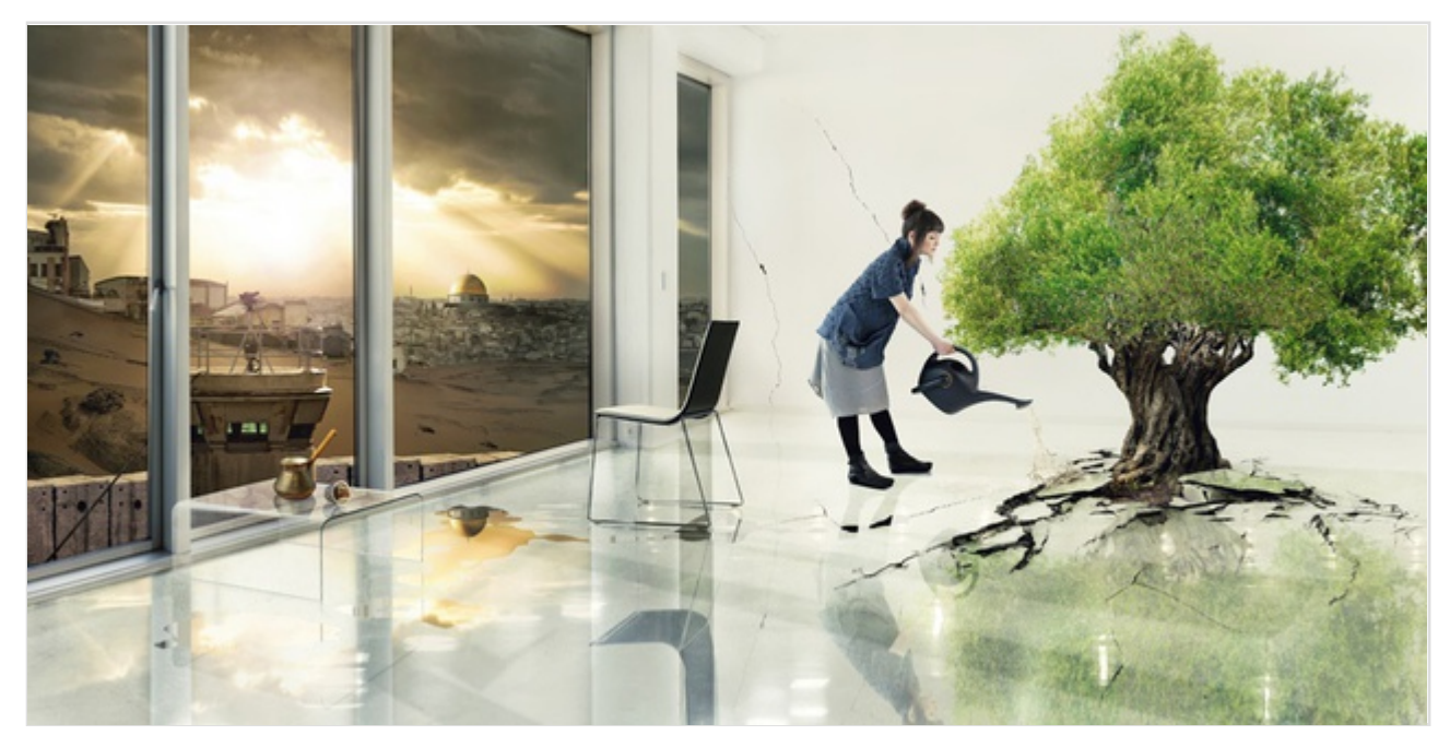
Larissa Sansour, Nation Estate , 2012, film still, 9 min. Courtesy the artist.

For me, Nation Estate follows the strategy of building undeniable facts on the ground, no matter how surreal. What I like about the use of sci-fi is that it always brings back the past and the future, but it never talks about the present. It seems that, as Palestinians, we have built an identity of being eternally suspended in space or stuck in limbo: we think about the Naqba, the tragedy and what happened, and we look for independence in the future. But meanwhile, on the ground, Israel is busy expanding its settlements on Palestinian land amplifying its reality.