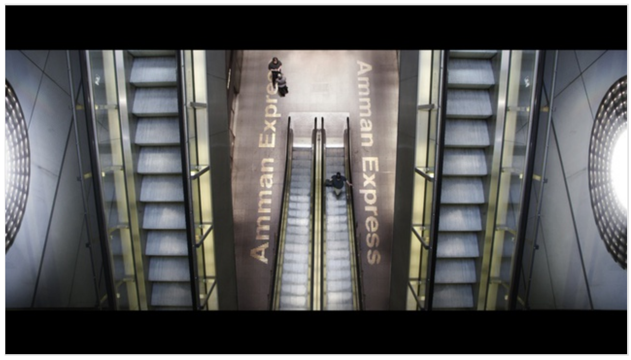
Larissa Sansour, Nation Estate , 2012, film still, 9 min. Courtesy the artist.

when you are in the midst of such a long struggle, your identity and things usually associated with it lose their value as they become cliché. I wanted to make the Nation Estate building like a museum that houses these symbols we are supposed to identify with; and because they are in this museum, they are not functional. They become exhibited artefacts. This included references to the keffiyeh and the key that we all know, plus certain foods like the olive trees. The embroidery on my pockets was actually embroidered by women in Bethlehem.